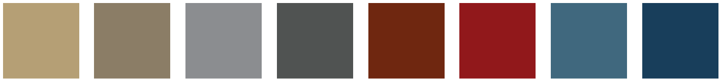
Rawhide Clay Light Gray Charcoal Rural Red Crimson Slate Blue Gallery Blue