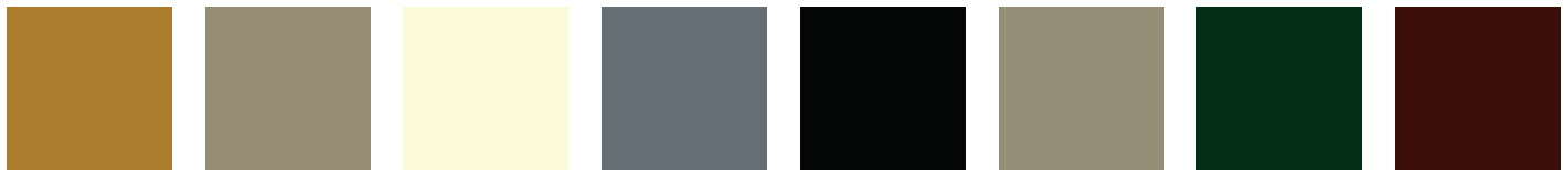
Stain Buckskin Navajo White Dark Gray Black Clay Dark Green Dark Brown