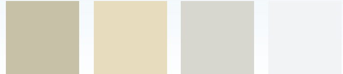
Light Stone Cobblestone Bone White White