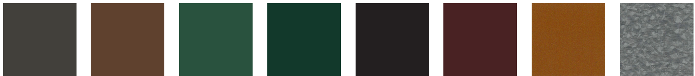
Burnish Slate Earth Brown Evergreen Forest Green Black Burgundy Copper Galvanized